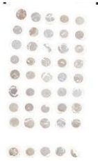
Figure 1 TMA non small cell lung cancer (click to show WSI)