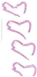
Figure 2 Liver biopsy LALD (Lysosomal Acid Lipase Deficiency) (click to show WSI)